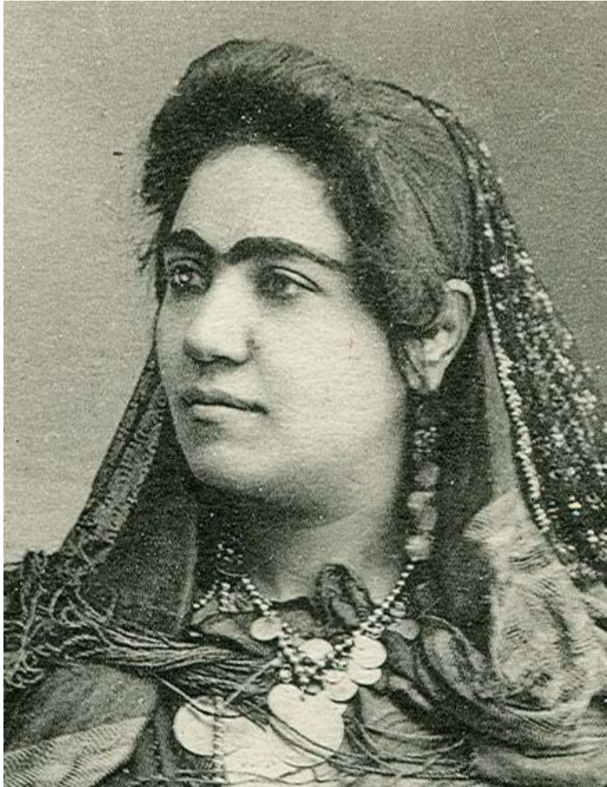
Detail: 181 – Egyptian Types and Scenes – an Arab Woman; Levy et Neurdfin, 44, Rue Letellier, Paris Author's private collection