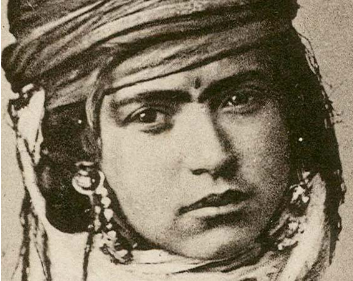
Detail: 1567 L'Afrique du Nord – Type de femme, Comber-Macon

Women often adjusted their eyebrow and eye paints to compliment their tattoos. The woman preceding, an Ouled-Nail, has a forehead tattoo, but has also made dots with kohl or harqus to accent the tattoo, and dots over her eyebrows also. She has a chin tattoo that is not visible without high magnification, and that tattoo is not accented with kohl.