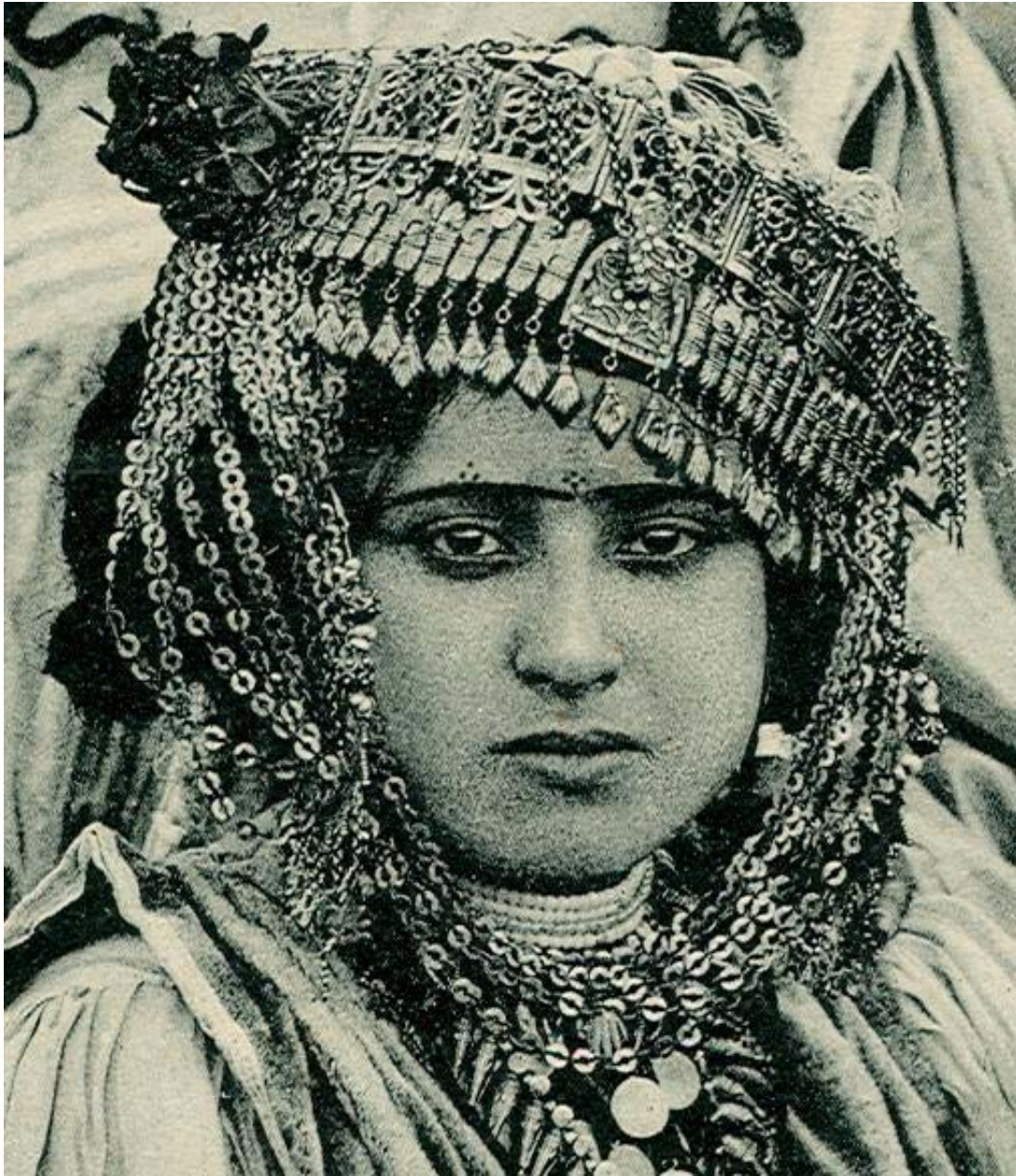
Detail: 1097 Scenes et Types Ouled-Nails, IMP, Levy fils a Cie, Paris, late 19 th or early 20 th century Author's private collection

forehead to protect them from the Evil Eye. Mothers applied kohl to their children, both male and female, until they were old enough to apply it themselves. As adults, females used kohl more frequently than males.