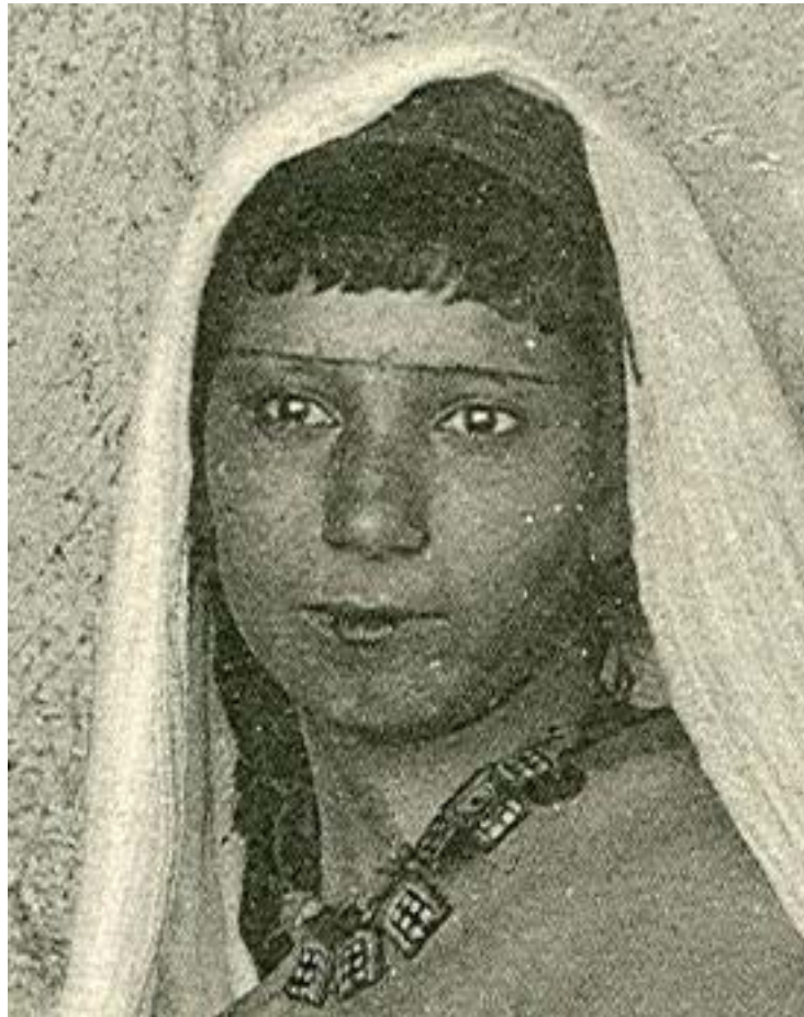
Detail: 7050 Scenes & Types du Maroc, Type de Femme du Souss – LL, Levy fils a Cie, Paris Auhor's private collection

reflection from the sand before sunglasses were invented. Lamp-black was the most common source of pigment, though galena, (lead sulphide), and stibnite (an antimony compound), were also used for black, and copper compounds for blues and greens. These metals were toxic to bacteria carried by flies and contaminated water, so they provided some relief from conjunctivitis and other bacterial eye infections. The irritation from having soot in one's eyes caused tearing, which kept the eyes washed clean of contaminants, grit, and bacteria. However, these toxic metals also entered the bloodstream of the wearer and the traditional formulae with these metals should never be used when there is safer cosmetic eye paint available.