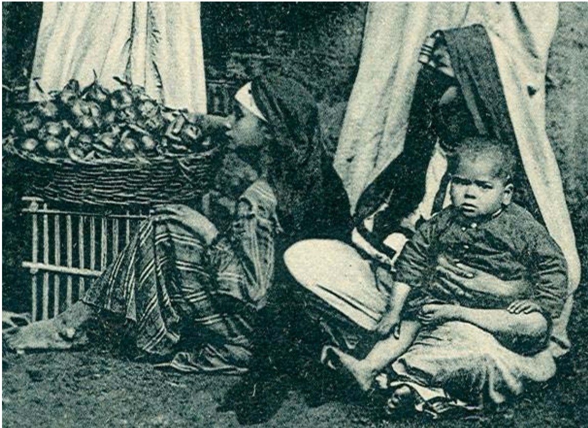
Detail: Marchand d'oranges, Union Postale Universelle Egypte Carte Postale

Some women believed that blackening their eyelids and eyebrows would protect them from the glance of the Evil Eye, and also prevent them from transmitting the Evil Eye to another person. Most women applied kohl every week, or for any social occasion, except during Ramadan, when kohl and all hennas were set aside.