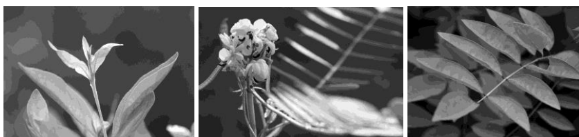
Henna, cassia, and indigo

Pure henna, cassia and indigo, in differing proportions and techniques, can produce the complete range of natural human hair colors from blond through red, brunette, and black. These methods were used across Arabia, the Middle East, the Levant, South Asia and Africa for centuries, but are now regarded as 'old fashioned'. It is going to require persistent marketing and education to dispel the notion that henna is inferior, that it destroys hair, is filthy, and can only make hair orange. Pure henna is not inferior to chemical dyes; it is simply a different technology. Pure henna does not harm hair; it strengthens hair, protects it from UV and desiccation. If skillfully applied, henna is no less tidy than chemical dye. Though the lawsone molecule is orange, it can be manipulated through a range of color, and with two other plants, can mirror the entire range of human hair and completely cover gray. Henna must be reframed as a safe,