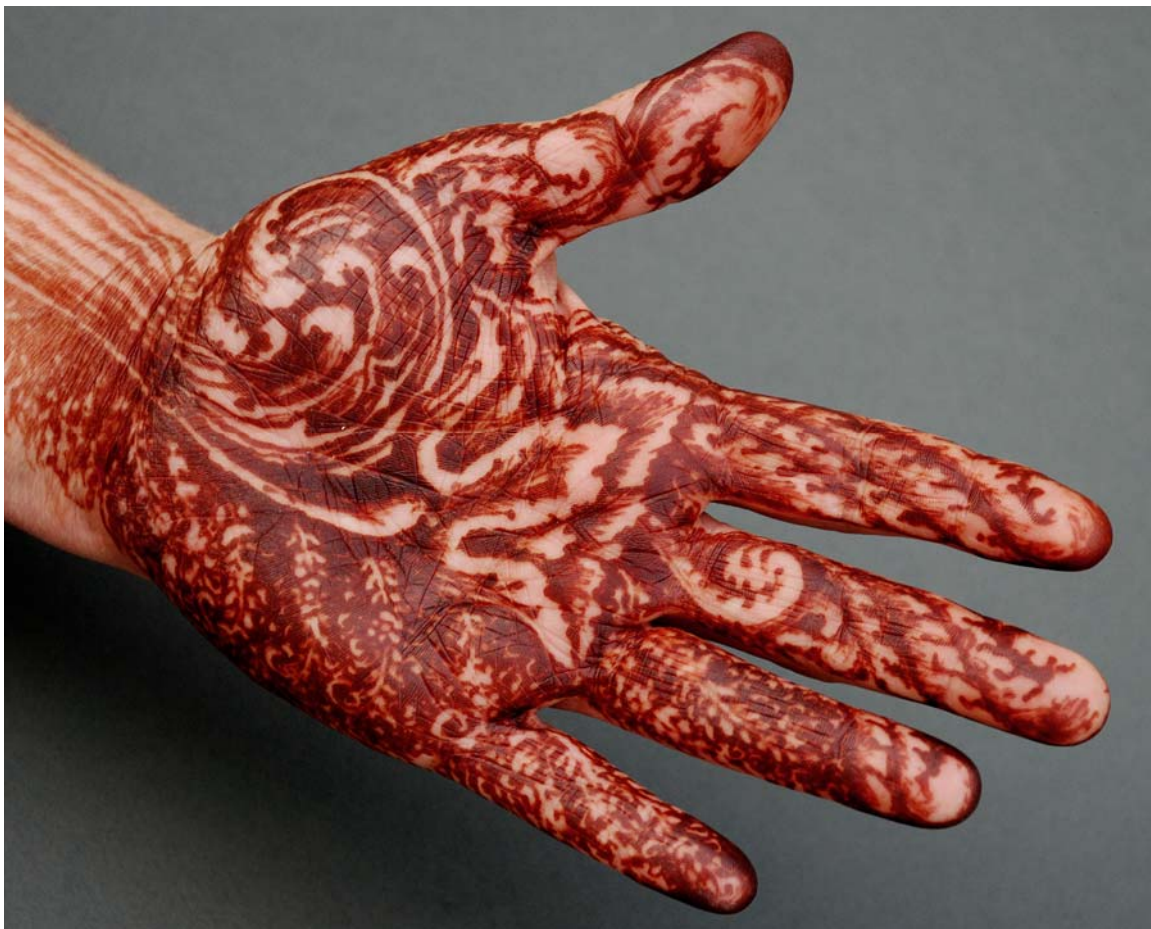
Figure 5: Hand stained with henna

Traditionally, henna leaves are pounded, sifted, mixed with a mildly acidic liquid, and this paste is spread on the skin. The dye in henna leaves, lawsone, penetrates and stains the epidermis an orange, red, or brown color. Though most of the dye remains in the stratum corneum, about 1% penetrates into the blood-bearing layer of skin (Kraeling and Bronaugh, 2007). This is harmless for most people, though lawsone will cause oxidative hemolysis in G6PD deficient blood cells. The skin of infants and children is generally thinner and more permeable than adult skin, permitting a greater and more dangerous uptake for G6PD deficient juveniles (Ya-Xian et al, 1999)