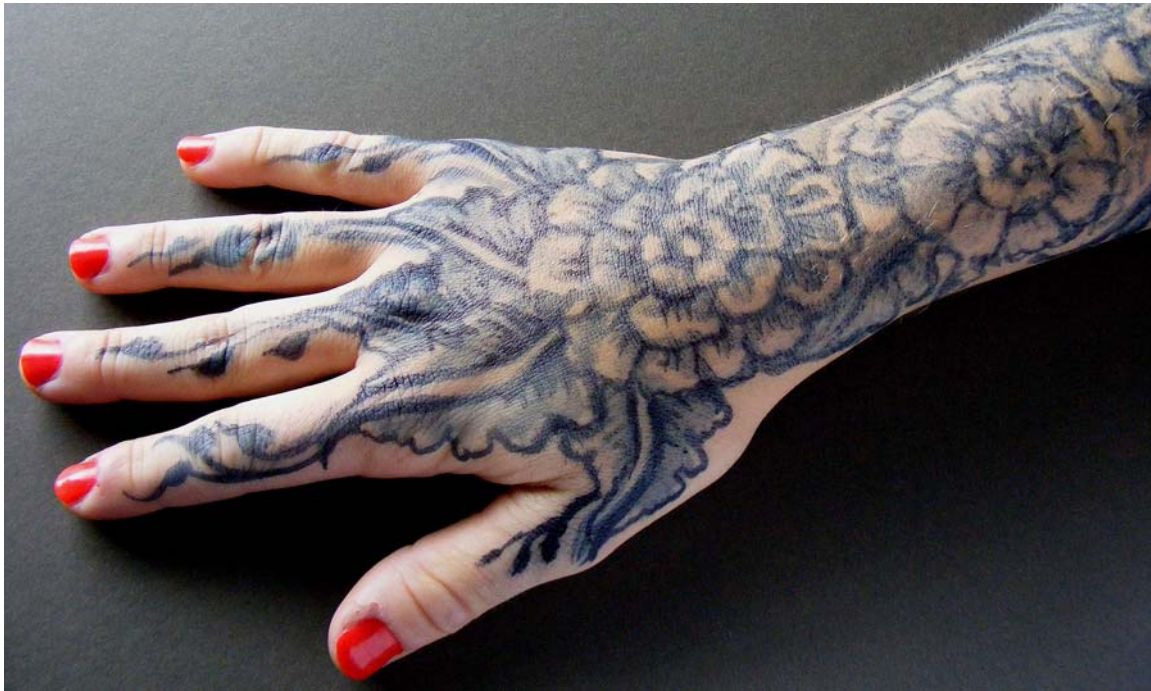
Figure 7: Arm stained with indigo patterns

cleaned with salt and painted with indigo, his survival might have been attributed to the successful expulsion of Lilith.