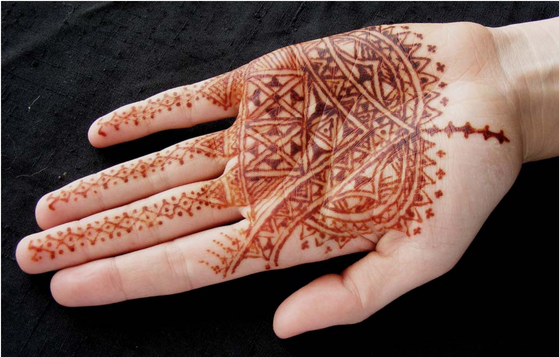
Figure 1 Hand Stained with Henna

Salt was also believed to be beneficent, and to deter supernatural spirits that brought sickness and death. One such demon to be averted was Lilith, named and described as a specific threat to infant males in the Talmud. Lilith is linked to early Hebrew לילית Lilit, and Akkadian Līlītu, lascivious predatory female supernatural spirits, and Lilith was identified as a dangerous spirit in Jewish culture during the biblical period.