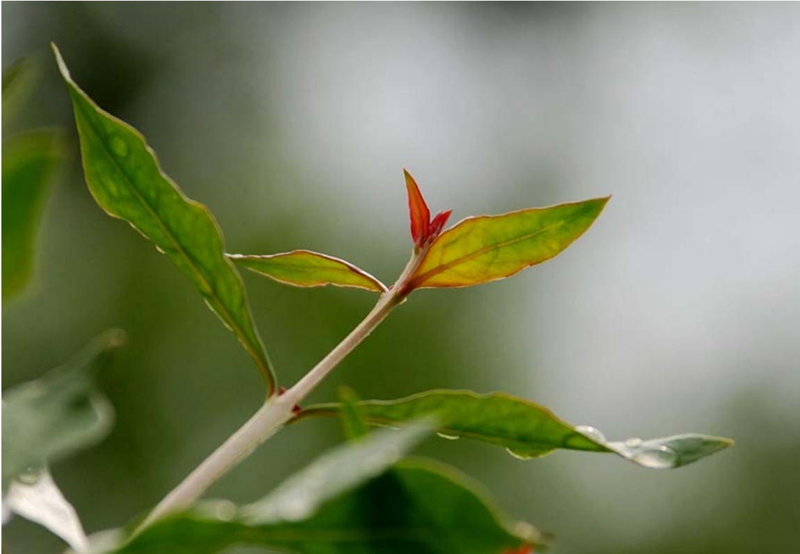
Figure 4: Henna, lawsonia inermis

Malaria is regarded as a positive critical evolutionary agent for increasing the G6PD deficiency rates in a population, while substances causing oxidative hemolysis are critical evolutionary agent for decreasing the rates (Simoons, 1998). If a malaria epidemic engulfs a community, G6PD deficient children are more likely to survive because they are genetically resistant, so rates of G6PD deficiency will be increased in the subsequent generation. If henna is applied to children, causing hemolytic crisis (particularly to males) before puberty, G6PD deficiency rates will be decreased in the subsequent generation.