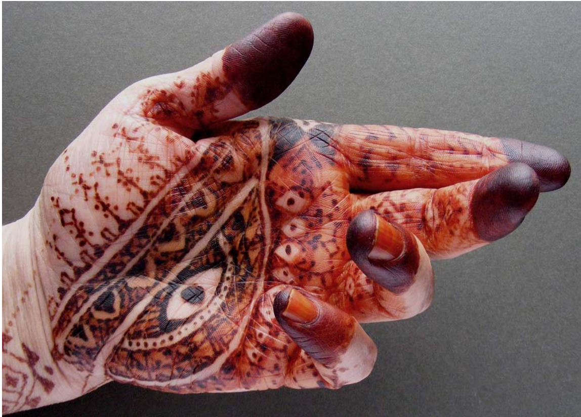
Figure 6: Hand and fingernails stained with henna patterns to avert the “Evil Eye”

Henna was also used in folk medicine, and was recommended in early Muslim medical texts such as “The Medicine of the Prophet” for specific illnesses. Henna was applied to feet and hair to relieve migraines. Henna was chewed to cure mouth ulcers, leg pain, and to relieve skin inflammation. If henna was used for these ailments harmlessly and beneficially on adults, then parents might assume it could be used on their children. Henna was used to cure thrush in infants, rubbed over their bodies to cure scabies, mixed with oil to treat burns, applied to children in early stages of smallpox, and applied to their hair to cure lice, dandruff and ringworm (Al-Jawziyya, 1998: 64-5). Though the curative powers of henna were attributed to its blessedness and ability to thwart malevolent supernatural forces, henna has been demonstrated to be genuinely anti-fungal, anti-inflammatory and effective against some bacteria (Muhammad and Muhammad, 2005) (Ali, et al, 1995).