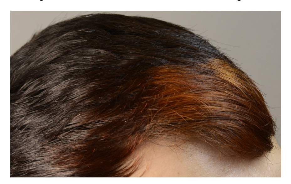
Chapter 10: Ancient Sunrise® Henna and Hair Lightener

You can use Ancient Sunrise<sup>®</sup> to dye lightened hair; you can lighten hair hennaed with Ancient Sunrise<sup>®</sup>. Because Ancient Sunrise<sup>®</sup> henna is laboratory tested to ensure that it is high quality and absolutely pure, it is possible to do things that cannot be done with compound henna dye. The residues of metallic oxides in compound hennas have a highly destructive chemical reaction with the activators in oxidative hair dyes. Most hairdressers have been warned to "never dye over henna because the hair may be destroyed." This is indeed the case with compound hennas. Because the ingredients in many packages of henna are not disclosed, the client and stylist will not know what's lurking in the hair ready to cause mayhem. Ancient Sunrise<sup>®</sup> is pure and we can prove it: you can work with hair lightener to create beautiful effects on hair dyed with Ancient Sunrise<sup>®</sup> as Anthony and Katrin do in the pictures above, and below.