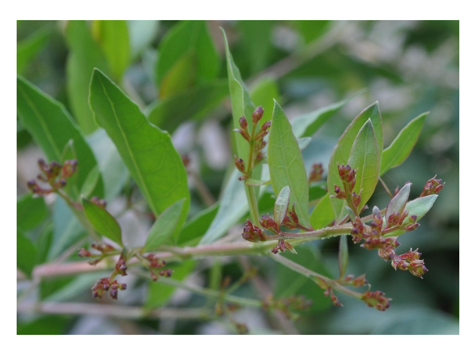
Henna with small clusters of flowers

In the Old Testament, henna is called camphire , <sup>10</sup> from the Latin word for henna, henna being an Arabic/Semitic word for lawsonia inermis. Henna was a beloved plant growing near Ein Gedi oasis, planted as hedgerows around the vineyards. The fragrant clusters of flowers and dense brushy cover were a favorite place for lovers to spend time together, and love poetry included henna as a metaphor for a loving relationship that was as beneficial as it was enjoyable. As a hedgerow, henna protected the grapes from desert winds and sand. Present-day farmers in tropical, semi-arid zones use henna as a hedgerow to protect their fields against desert encroachment. Henna hedgerows keep wildlife and livestock out of farm gardens and define boundaries. When livestock have been nibbling at henna plants, their lips are stained red-orange as if they're wearing lipstick.