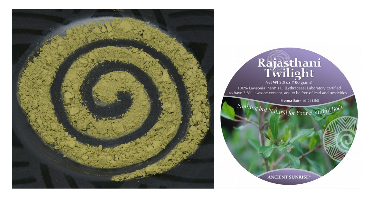
Ancient Sunrise® Henna Powder

Henna powder smells a bit like a bale of hay. The earthy henna scent lingers in hair and on skin. People perceive the scent differently; some people love it, and some dislike it. If you dislike the scent of henna, mix ginger powder into the henna paste to reduce the odor. Cardamom powder can also mask the odor of henna. In any case, the henna scent will go away after a few shampoos.