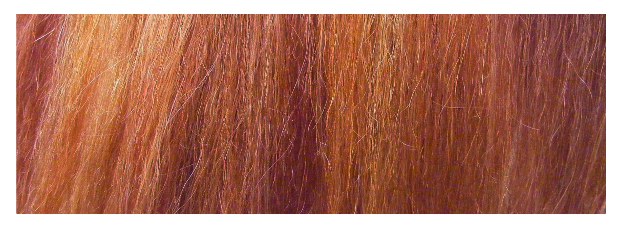
Variations of color with different lawsone content hennas and different acidic mixes, on identical samples of light colored hair

The acidic paste maintains the hydrogen atoms on the corners of the aglycone, the intermediate form of the lawsone molecule. In acidic mixes of henna, the intermediate form of lawsone will migrate into the keratin in hair or skin, and darken as it binds permanently with the keratin by a Michael Addition. If the henna powder is mixed only with water, the hydrogen atoms are not as well conserved. Henna mixed with water is more likely to fade from air because unbound lawsone will gradually wash out of hair. Henna mixed with a mildly acidic mix will leave a stain in hair that is not only permanent, but will gradually darken, and continue to darken for years.