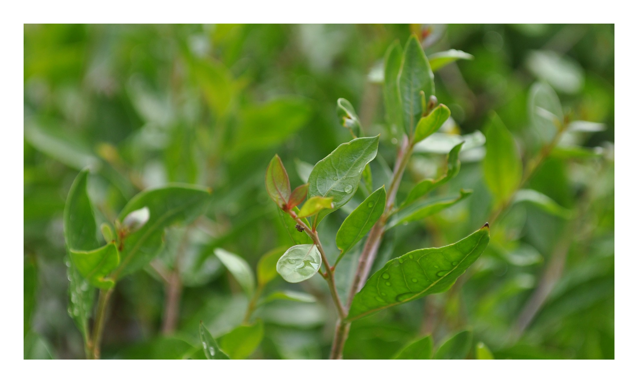
Henna, lawsonia inermis

The fully-grown leaves contain 0.3% to 4% lawsone content, depending on climate, weather, and soil conditions. Commercially available pure henna sold for body art typically has 1.7% to 2.4% lawsone after milling, packaging and export. The lower dye content leaves, 0.3% to 1.1% lawsone, roughly powdered and sifted, are sold to the hair dye industry.<sup>3</sup> It is not true that the greenest leaves have the highest dye content, though brown leaves may be poor quality. Indian henna exporters often put green dye in their henna to make it appear to be better quality.<sup>4</sup> Ancient Sunrise® henna does not contain green dye.