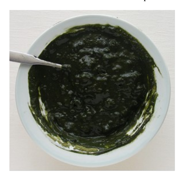
Ancient Sunrise® indigo mixed with water

Stir until there are no more dry lumps in the indigo paste. It takes some determination to get all the indigo powder wet.