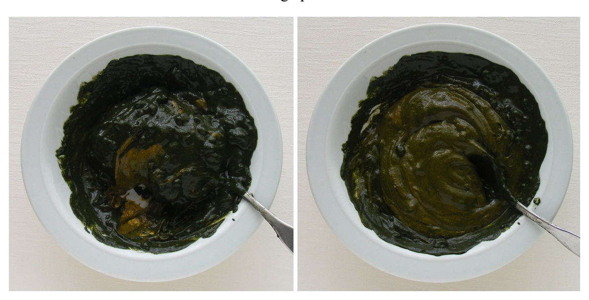
Stir the henna and indigo pastes together

Stir until the two pastes appear to have completely merged, then keep stirring. If the two pastes are not completely mixed, the resulting color will be splotchy.