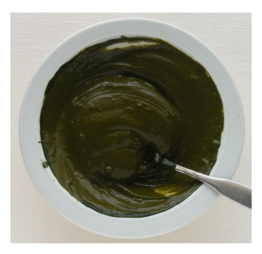
Henna and indigo mixed completely, ready to use.<sup>2</sup>

The dye molecules in indigo will change from the indoxyl state to the blue indigo state after about twenty minutes of exposure to air and acidic henna, and the longer the paste sits, the less effective it will be as a brunette hair dye. If you let your henna and indigo mix sit out too long, the henna red will prevail over the indigo tones. Keep your henna in one bowl and in a second bowl mix a small amount of indigo into henna and use that quickly. If you mix up the whole batch together at once you'll lose some of the indoxyls before you get all of the mix applied, and the results may be redder than you wished. Mix as much henna and indigo together as you can use in about twenty minutes. If you leave a henna-indigo mix in your hair overnight, you may find that more lawsones have migrated into your hair, and fewer indoxyls, because the indoxyls were lost to air and acidity, while the lawsones kept going strong.