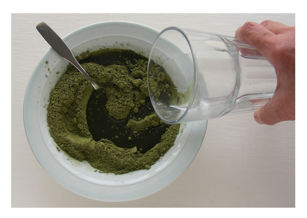
Add distilled or filtered water gradually to Ancient Sunrise® indigo powder stirring after every addition. Do not add an acidic liquid!