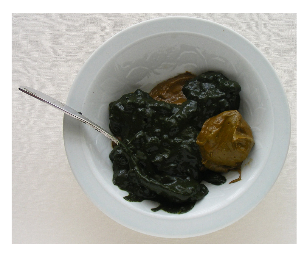
Add previously mixed and dye released Ancient Sunrise® henna, or henna and cassia, to the indigo paste