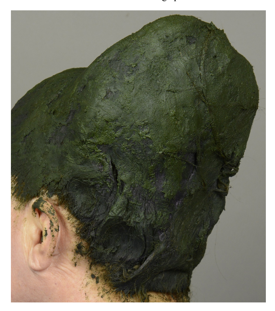
Yes, this is a lot of indigo paste, but the full length only needs to be done once or twice a year.