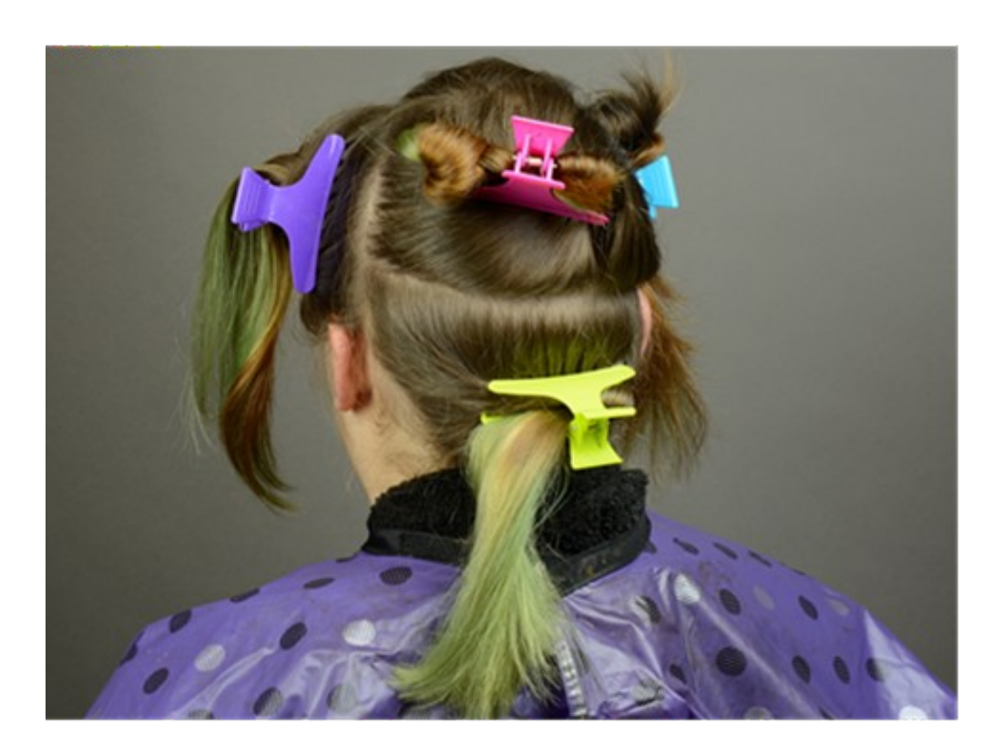
Maria mixes Ancient Sunrise® and dilute lemon juice one day ahead.¹ She sections Emily's hair before she begins the cassia application.