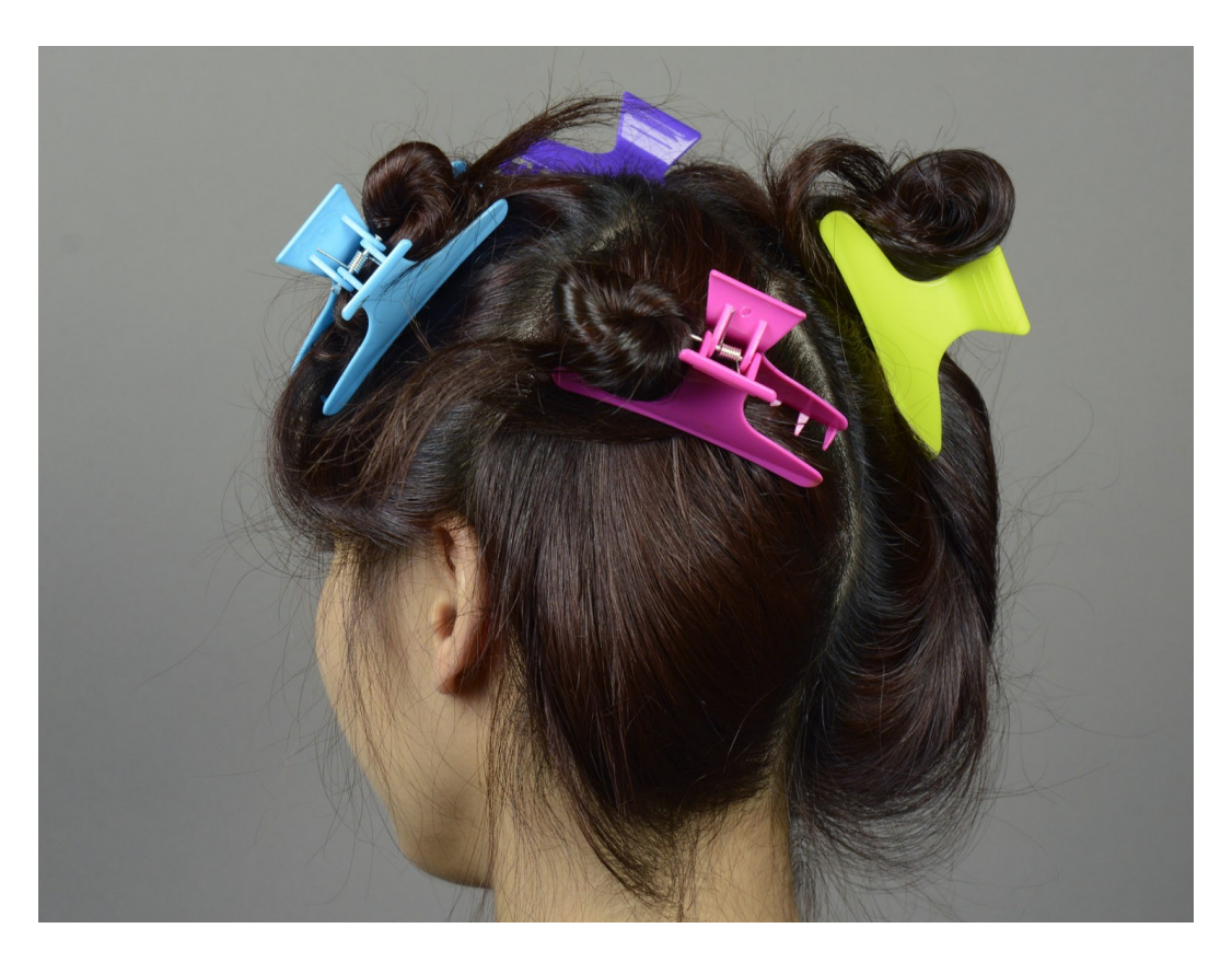
Jiji has nearly black hair which she tried to dye with a chemical red dye. The results were not what she hoped for. She mixes 500g of Ancient Sunrise® henna with cranberry juice and lets it sit overnight.