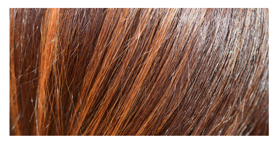
In Chapter 10 you can learn more techniques of bleaching into hennaed hair.