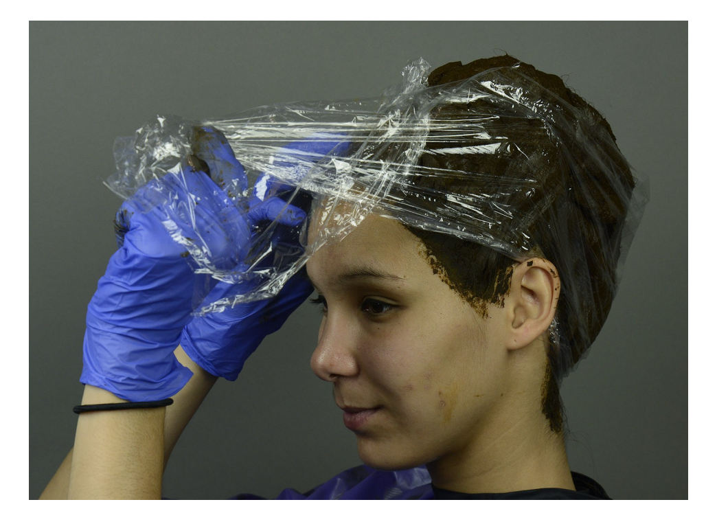
She wraps her hair with plastic wrap to keep it warm and moist for a few hours.