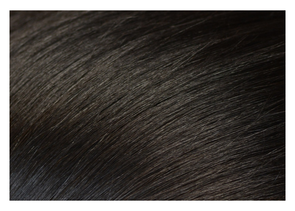
Blonde, graying hair dyed with 80% indigo and 20% henna is lustrous and is a very natural looking warm black.

Allow about 16 oz of paste or 50g of powder to dye roots; you will need to calculate how many grams or spoonfuls of henna, cassia, cassia and henna or henna and indigo paste you will need. Counting heaping spoonfuls of powder or paste may be the easiest way to do this. Remember, henna is not finicky, so you don't need to be very precise.