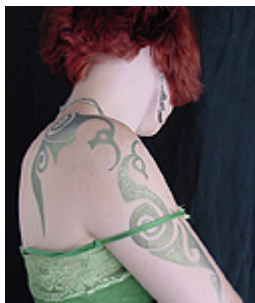
Gilding with resin-based body paint