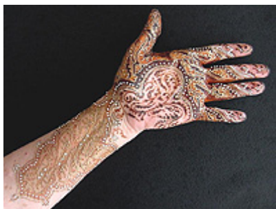
An example of gilding work over henna from Warrior

Gilding Techniques: Spiking Gel and Hair Glue Method