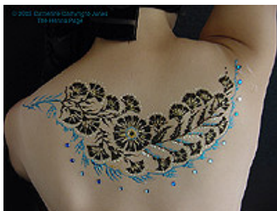
Gilding and Gems with paste