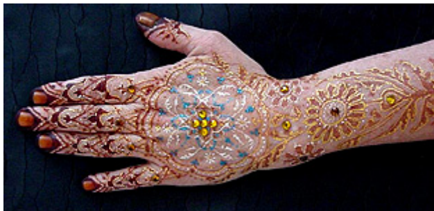
Gilding and Gems as adornment to paste and stain: 1