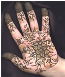
Willowhawk's Gilding and Glitter Mix