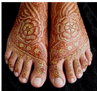
Gilding over henna stains