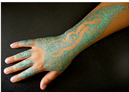
Glitter work done with hair glue