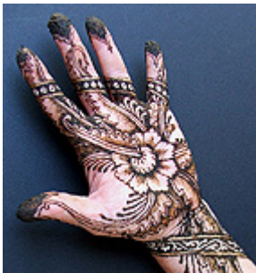
Gilding paste used for reverse work: 2