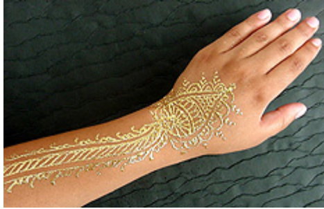
Glitter work with medical adhesive