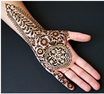
Gilding paste for reverse work: 1