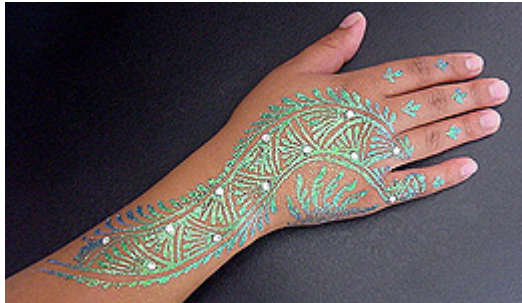
Glitter work with resin-based body paint