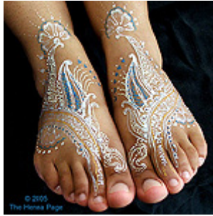
Gilding pastes and gems