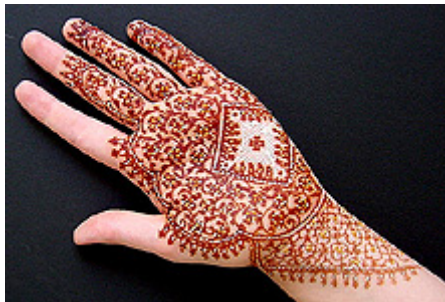
Gilding paste as an adornment to paste and stain: 2